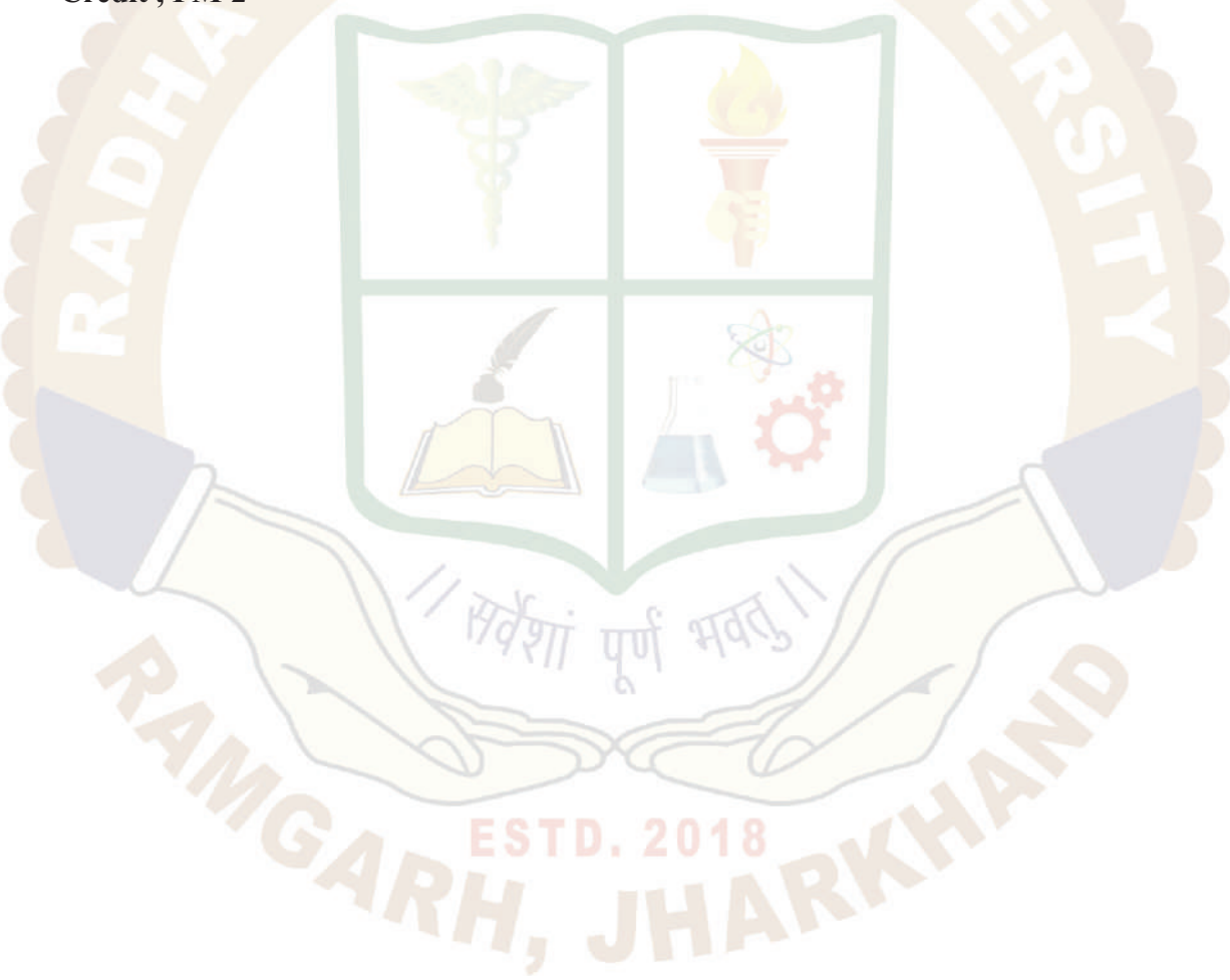
Paper 6, Ability Enhancement Compulsory Course (AECC), English/MIL, 2 Credit, FM 2